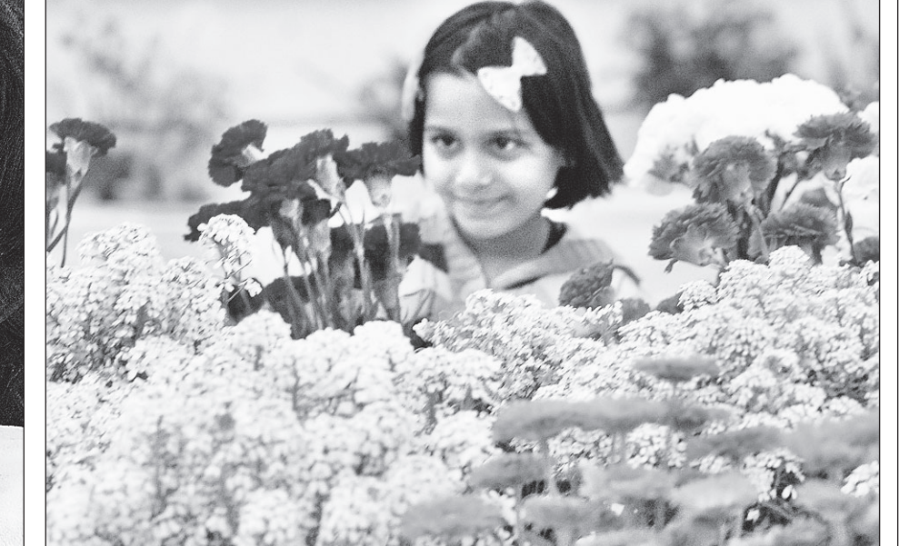
A participant cuddles a puppy at a dog show organised by Orange City Canine Club at Tilak Nagar ground on Sunday. Right: A girl at a flower show organised by Nagpur Garden Club at Kusumtai Wankhede Hall